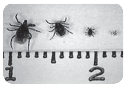
From left to right: The deer tick (Ixodes scapularis) adult female, adult male, nymph and larva on a centimeter scale. Note: Tick larvae do not transmit Lyme disease.

and slowly taking in blood. Both deer and rodent hosts must be abundant to maintain the enzootic cycle of Borrelia burgdorferi. Ixodes ticks are most likely to transmit Lyme disease to humans after feeding for two or more days.