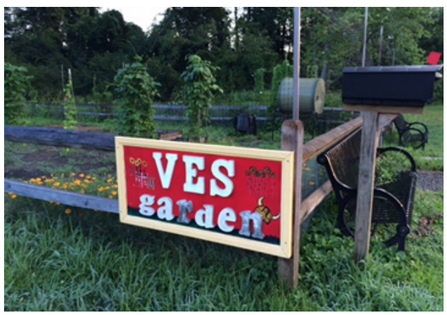
Tour stop # 2, Vienna Elementary School Community Garden

Stop by the Vienna Community Center, 120 Cherry Street SE, on September 14, to pick up your tour map or print one off of the Town's website after September 10. Parking is available at the Vienna Community Center. Visitors are encouraged to bike or walk the tour! Free and open to everyone. For more information, visit viennava.gov.