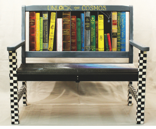
Unlock the Cosmos by Dore Skidmore

benches will be located at businesses on Church Street with additional benches placed on Maple Avenue, Mill Street, Center Street, and other various sponsor locations throughout Town. Brochures with a map of bench locations will be