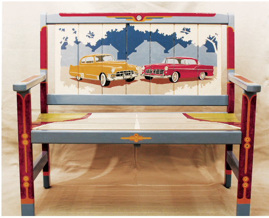
Enginuity by Ken Britz

Public locations that will feature benches include the Town Green, Glyndon Park, and the dog park near Nottoway Park, Several