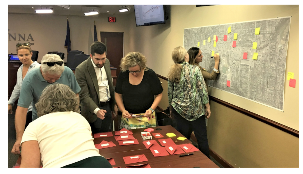
Transportation conversation Residents provided feedback at the June 12 transportation study community meeting.

In addition, Kimley-Horn sought input from meeting participants on their top priorities for transportation improvements along the Maple Avenue corridor. The priorities survey and an investment activity also are available to Vienna residents to download at viennava.gov/multimodalstudy and complete through