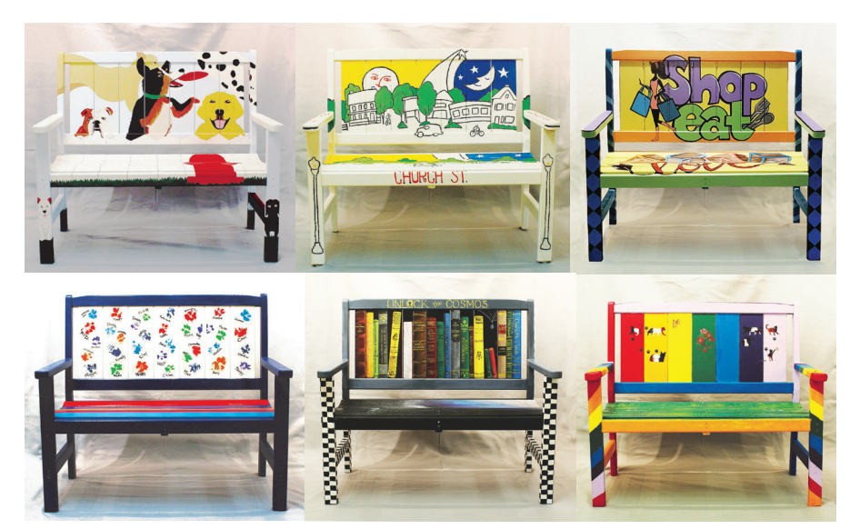
Vienna gets benched These Vienna Arts Society-created benches are among the eight that will remain on display in public locations following a November 2 live auction.

• Three benches will be placed at the Vienna Dog Park, including Sit, donated by Alan Chickinsky; Play