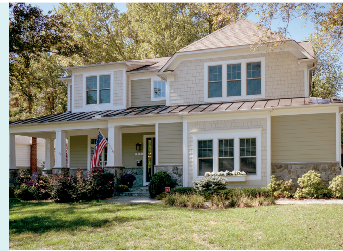
An Energy Star home in Vienna

There are enduring benefits for all of us when we consume fewer resources. The consumption of fossil fuels is directly associated with climate change, acidification of the Earth's oceans, destructive fossil fuel extraction technologies, water pollution, national security challenges and more.