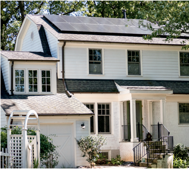
A "Solarize Vienna" home