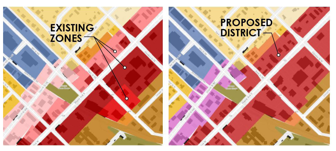
Districts vs zones The map on the left shows existing zoning scattered along Maple Avenue; the map on the right demonstrates a proposed district of one combined geographic area.