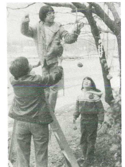
Last month members of Brownie Troop 1445 decorated the trees in front of Town Hall with late winter goodies for the birds and animals. This spring the 12 girls, who are third graders at Louise Archer Elementary, will plant flowers at Patrick Henry Library.

If approved as a permit parking zone, weekday parking in the area would be restricted during set hours to the residents, their guests, and others having business there, who would be issued special parking permits by the Town.