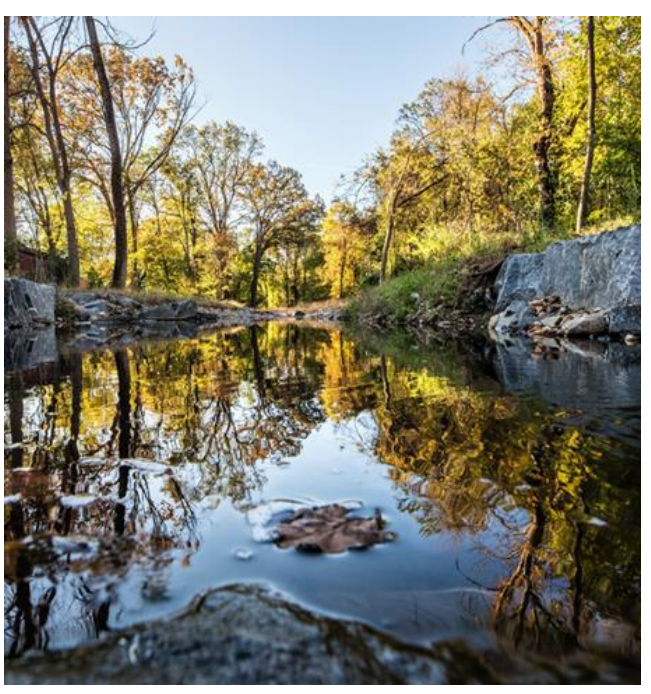
are available at fairfaxwater.org/swap .