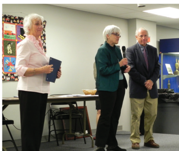
Mayor Seeman presents awards to volunteers during the recognition program in 2011.

This festive celebration of service begins with music performed by "The Jammers," a beloved children's percussion ensemble. Then the recognition program begins with the "Pledge of Allegiance," led by local scouts or an award recipient, followed by the ceremony to recognize volunteers for a range of activities from small neighborly acts to community wide service.